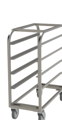
PR35-S-126-36 Half-size, for 12" x 30" Platters