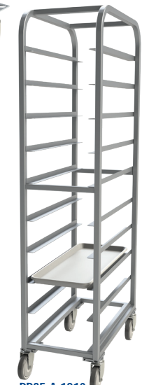
PR35-A-1210 Full-size, for 12" x 30" Platters