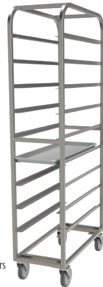
PR35-S-1210 Full-size, for 12" x 30" Platters