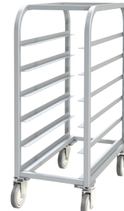
PR35-A-126-36 Half-size, for 12" x 30" Platters