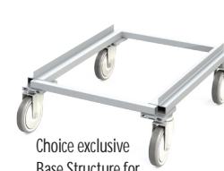
Choice exclusive Base Structure for rigidity and stability