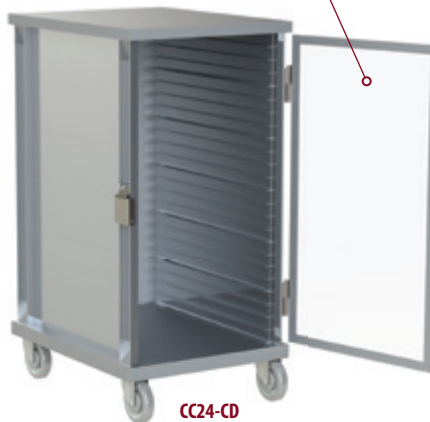
CC24-CD Clear Door

NEW! -CD: CLEAR DOOR OPTION for Easy Viewing