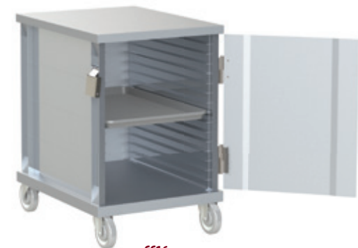
CC16 Solid Door