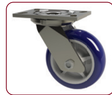
-620U 6" x 2" Heavy Duty Poly Urethane Casters Upgrade Option