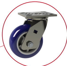
HD Casters High Quality 5" x 2" Polyurethane swivel casters