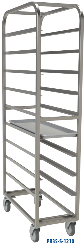
PR35-S-1210 Full-size, for 12" x 30" Platters