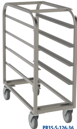
PR35-S-126-36 Half-size, for 12" x 30" Platters