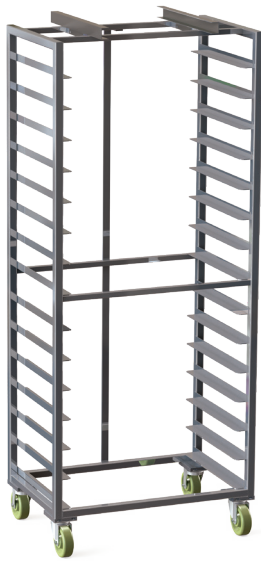
PR80-A-2615-BX-B-TG Side Load (For Double Rack Ovens)