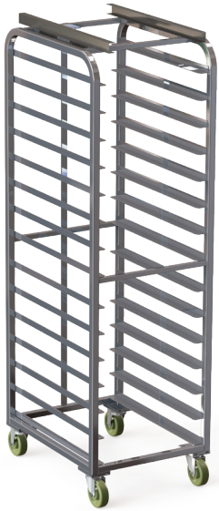
PR80-A-1815-BA-B-TG End Load (For Single Rack Ovens)