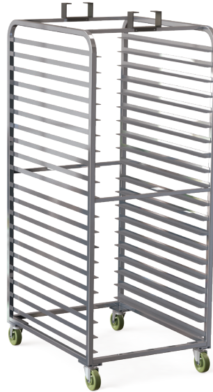
PR80-A-2620-D-RV-C Double Side Load (For Double Rack Ovens)