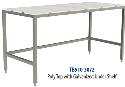
TB510-3072 Poly Top with Galvanized Under Shelf