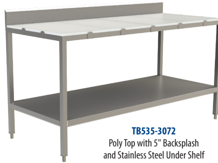
TB535-3072 Poly Top with 5" Backsplash and Stainless Steel Under Shelf