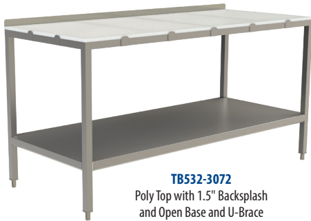
TB532-3072 Poly Top with 1.5" Backsplash and Open Base and U-Brace